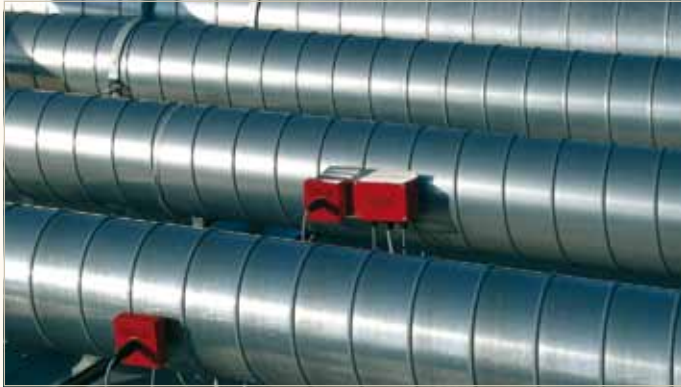
Extraction system with spark detectors