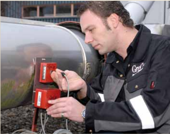
Experimental station - permanent development

Rapid connections and a modular design make the replacement of components easy. The stand-by batteries of the console are maintenance-free.