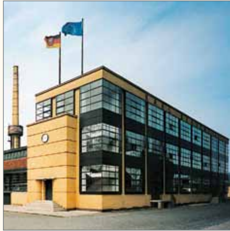
OUR HEADQUARTERS AT ALFELD - BUILT BY WALTER GROPIUS IN 1911