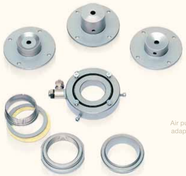
Air purge adapters