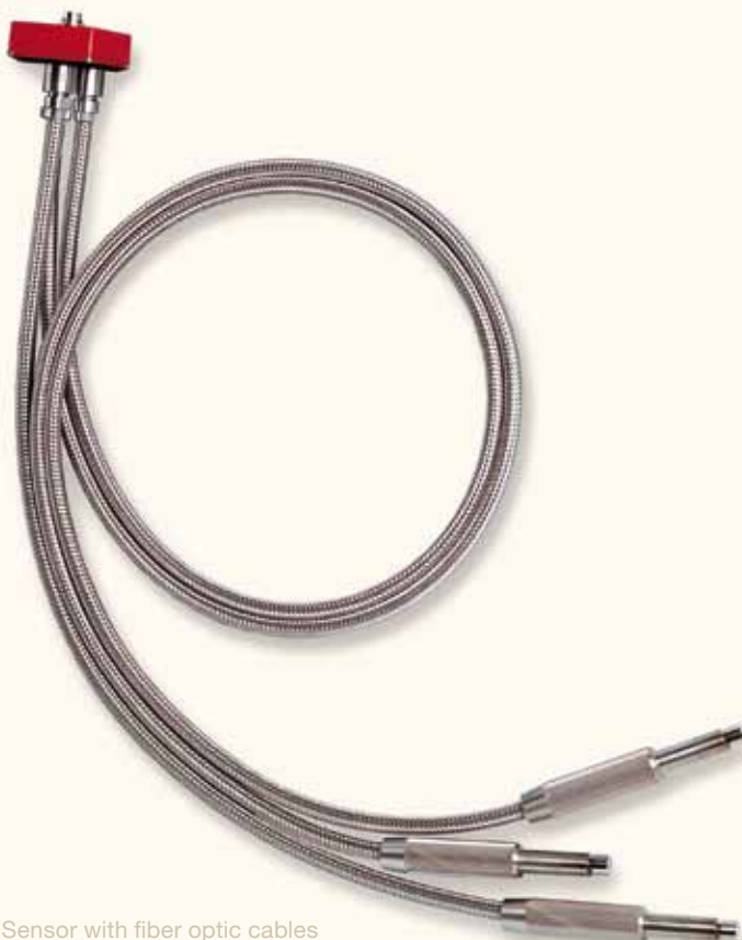
Sensor with fiber optic cables

Burning embers deeply hidden in the material release gases. These gases can be detected - in a silo or storage bin - by a combustion gases detector. This provides preventive fire detection before the gases ignite.