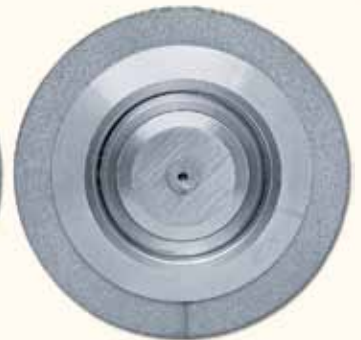
Mounted extinguishing nozzle