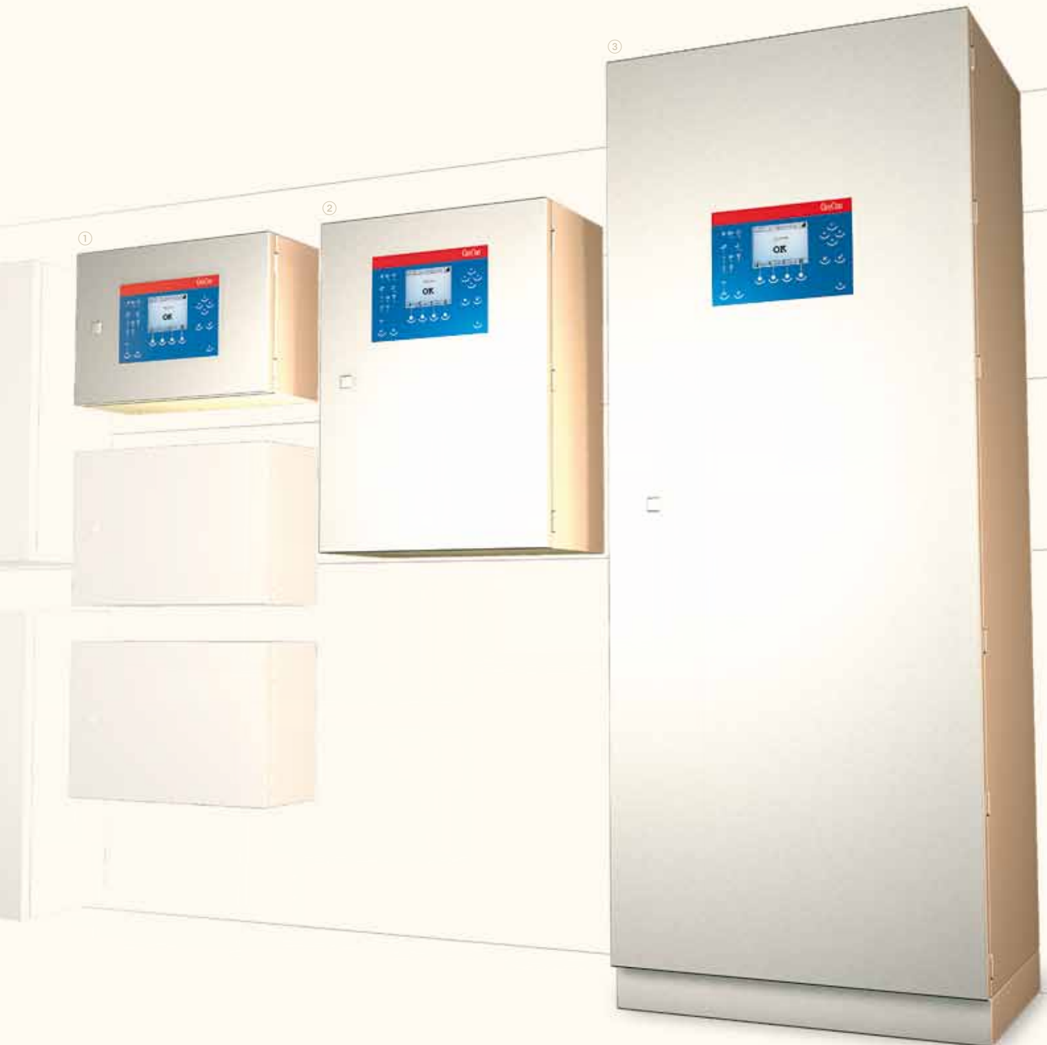
①·②·③ Control consoles with different capacities