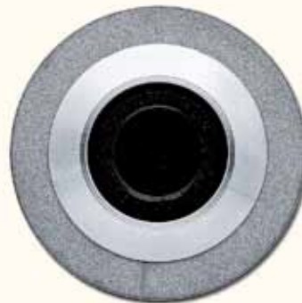
Mounted spark sensor

Sensors and spray nozzles are flush-mounted in the duct walls with special mounting adapters can be screwed or welded so that they do not obstruct the material flow.