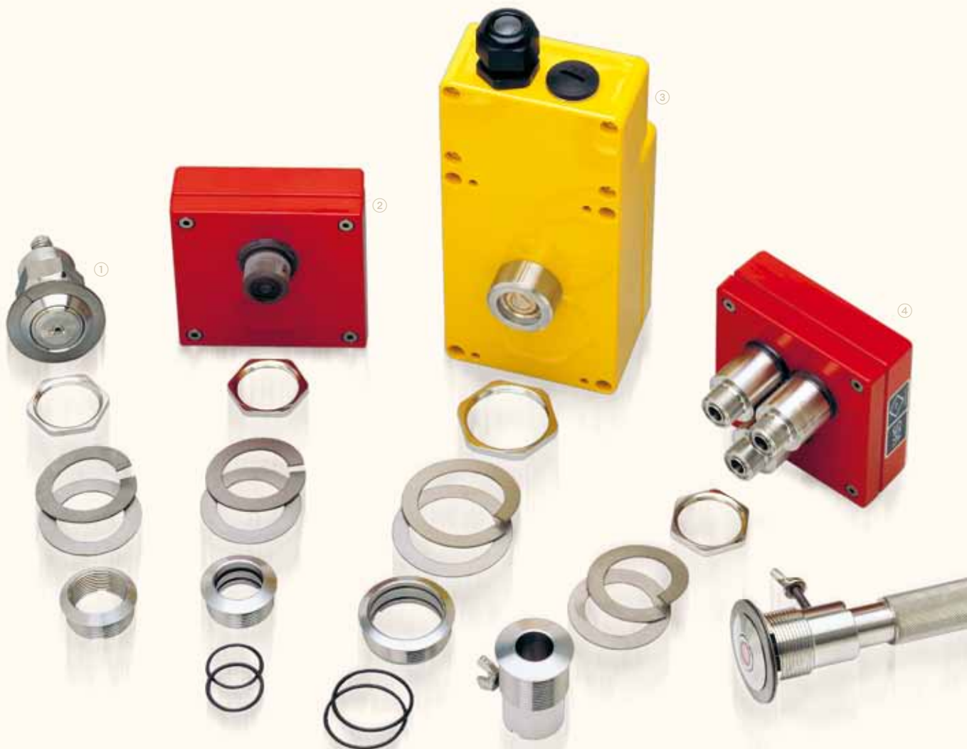
① Extinguishing nozzle* · ② Spark sensor* · ③ Daylight spark sensor* · ④ Fiber optic spark sensor* * with mounting adapter