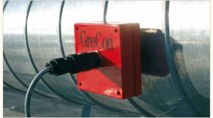
Mounted spark detector