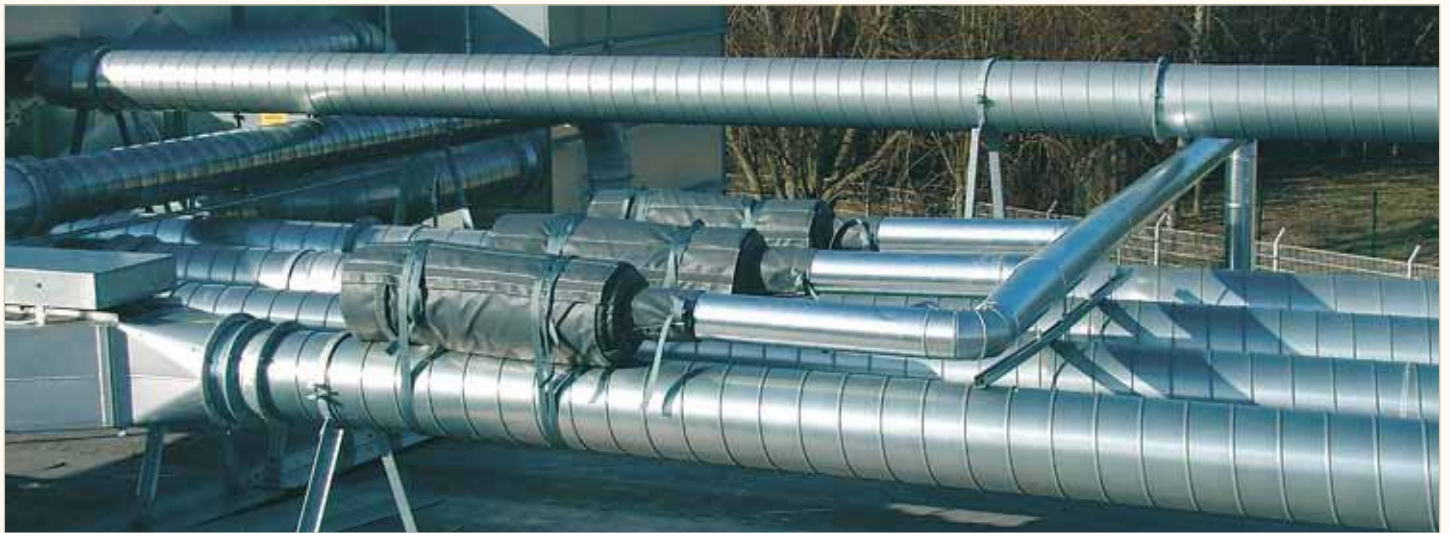
Anti-freeze protection of extinguishing devices with insulating bags