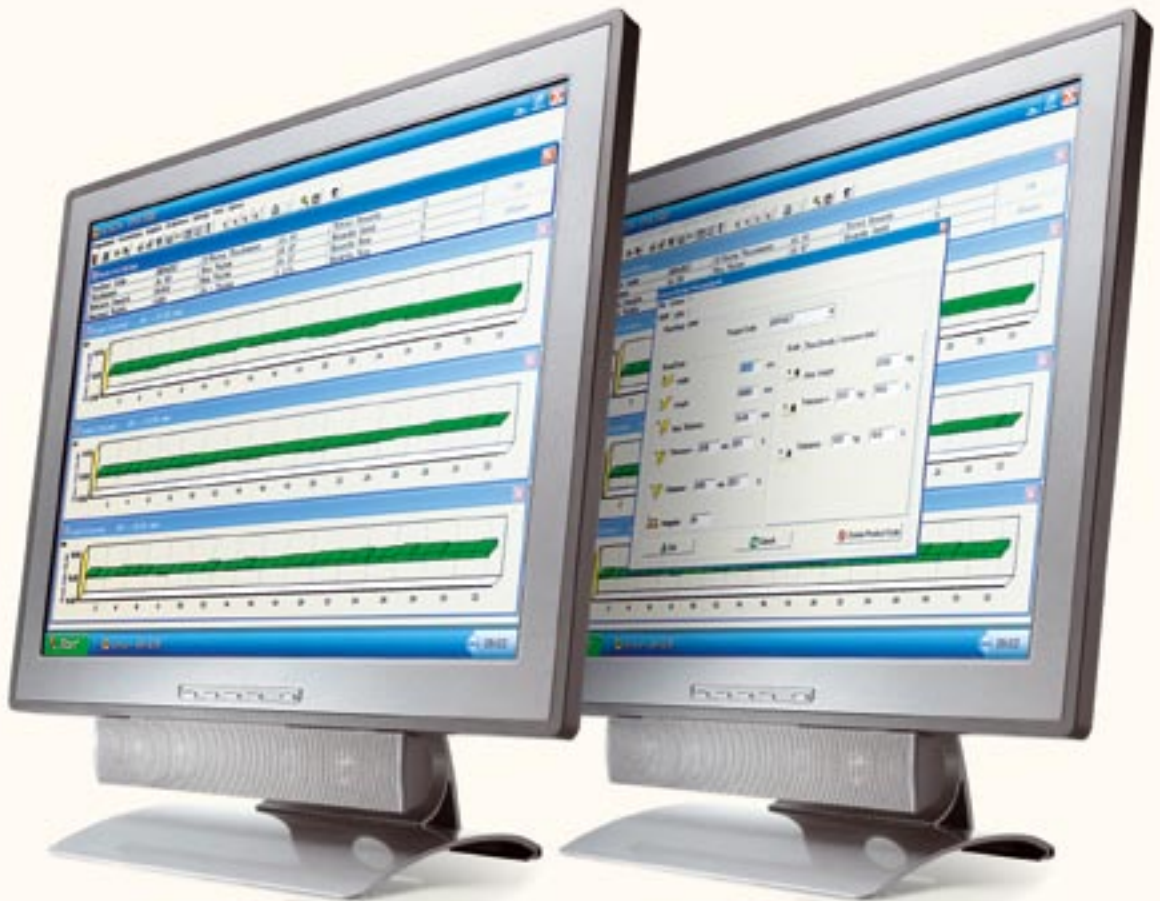
Visualisation of thickness values

GreCon measuring systems are equipped with a modem, by means of which a direct connection to the GreCon after-sales service can be made. Support, changes in parameters, software updates and trouble shooting are all possible online.