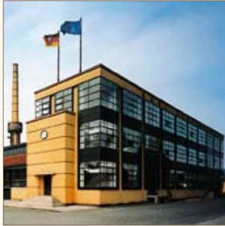
Fagus Factory, constructed by Walter Gropius in 1911

GreCon, Inc. 15875 S.W. 74th AVE. TIGARD OR 97224